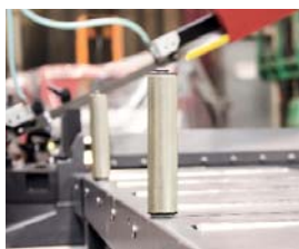
Vertical side rollers

With the bearing capacity up to 150 kg/m, a wide range of optional accessories, and connection pieces to BOMAR bandsaws, the "M" System is ideal for handling material in your workshop. Thanks to their default length of 2 and 3 m, roller tracks may be flexibly adjusted to any environment.