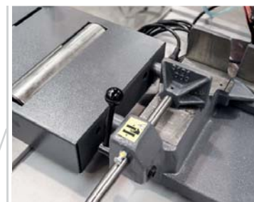
Connection of the inlet roller conveyor - detail