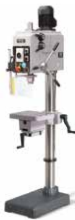
With reversible tiltable table with vice (MFM).