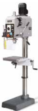
With rotating table (MG).