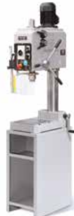
With floor cabinet with 2 shelves (PKA).