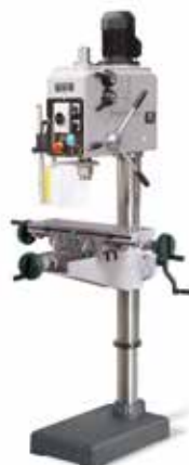
Co-ordinate table (MCC).