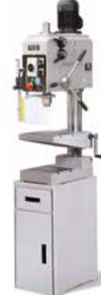
With floor cabinet with door and drawer (PKB).